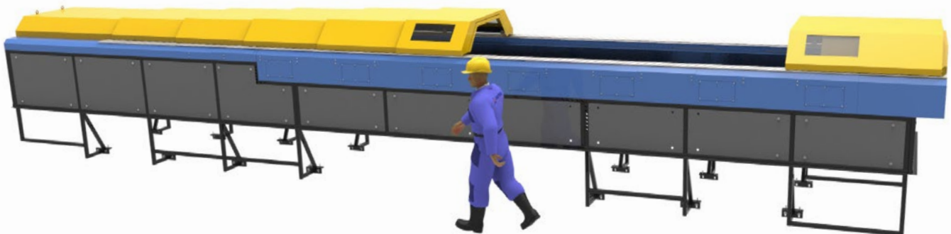
Covering of electro - erosive machine including telescopic covers

The very specialized demands require solutions which provide answer to health, safety and environmental issues. The focus is primarily on the tightness of the enclosure to protect operators as well as expensive machinery. Important are various switches, glass see through, door closers, mechanical resistance, noise insulation, vapour recovery, air condition etc.